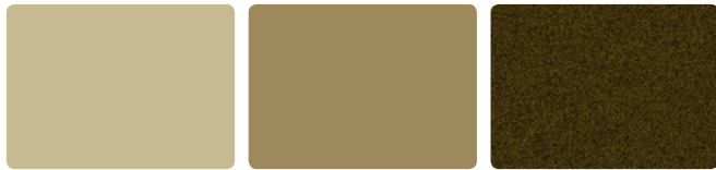
Golden Beach ALC004

Introducing an innovative new range of anodised effect colours that combine the unique style and aesthetics of anodising with the protective qualities of a high quality powder coated finish.