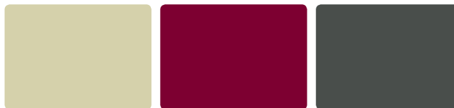
Chedworth Green CWD013