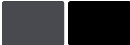
Steel Grey ALC008