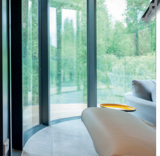
Images shown illustrate a type of application suitable for the product and are not binding in technical specification or detail.